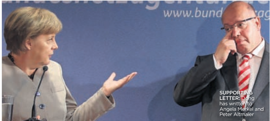
SUPPORTING LETTER: Dong has written to Angela Merkel and Peter Altmaier