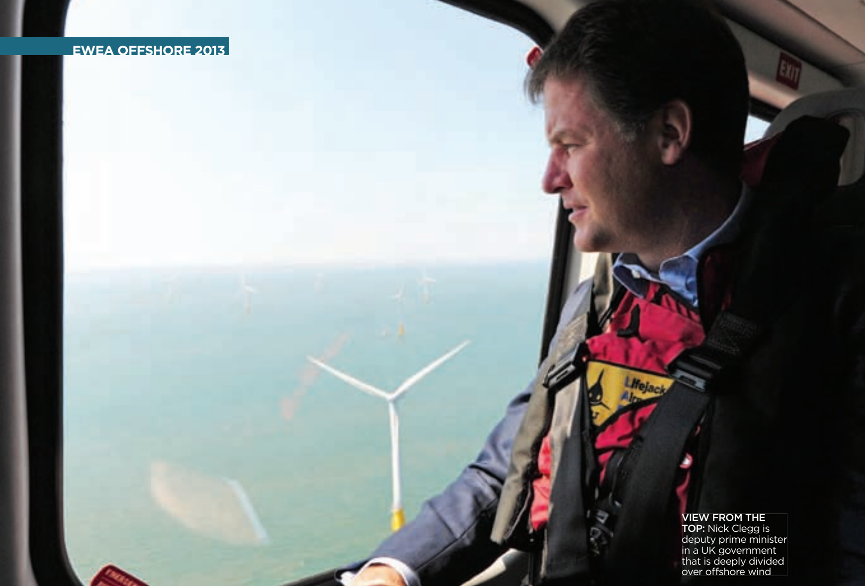
VIEW FROM THE TOP: Nick Clegg is deputy prime minister in a UK government that is deeply divided over offshore wind