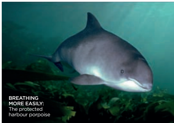
BREATHING MORE EASILY: The protected harbour porpoise

Following the findings, the BSH has stipulated that sound levels must not exceed 160 decibels within 750 metres of construction sites. The BSH expects this regulation to be introduced as a guideline across the EU. ☒