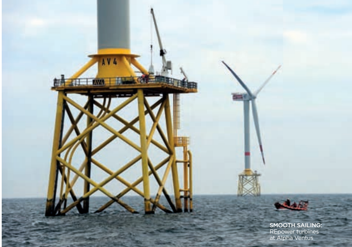
SMOOTH SAILING: REpower turbines at Alpha Ventus

The rotation of the blades seems to drive away birds, and developers do not have to worry about fixed migration routes — there are none in the North Sea, the researchers discovered, as the creatures are not bound to rest areas or specific thermal conditions. There was also no impact on marine mammals during operation. During the installation process, however, the endangered harbour porpoise