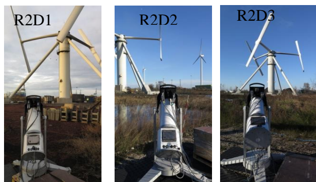
Fig. 1 Short-range WindScanners in operation around the Nenuphar VAWT at Fos-sur-Mer, Fr.

Nenuphar and Risoe DTU collaborated in acquiring unique 3D wind field measurements around an onshore prototype of an offshore floating VAWT concept. The mobile 3D remote-sensing laser-based WindScanner facility www.windscanner.dk provided 3D wake measurements around the large-scale onshore prototype of NENUPHAR operated at an onshore test site well-exposed to the strong Mistral winds near Fos-sur-Mer, Southern France. The WindScanners measured the mean and turbulence flow fields within and behind the 42 m tall and 51.5 m wide VAWT. The campaign resulted in a total of 37 wind field runs.